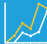
Reporting & Analytics