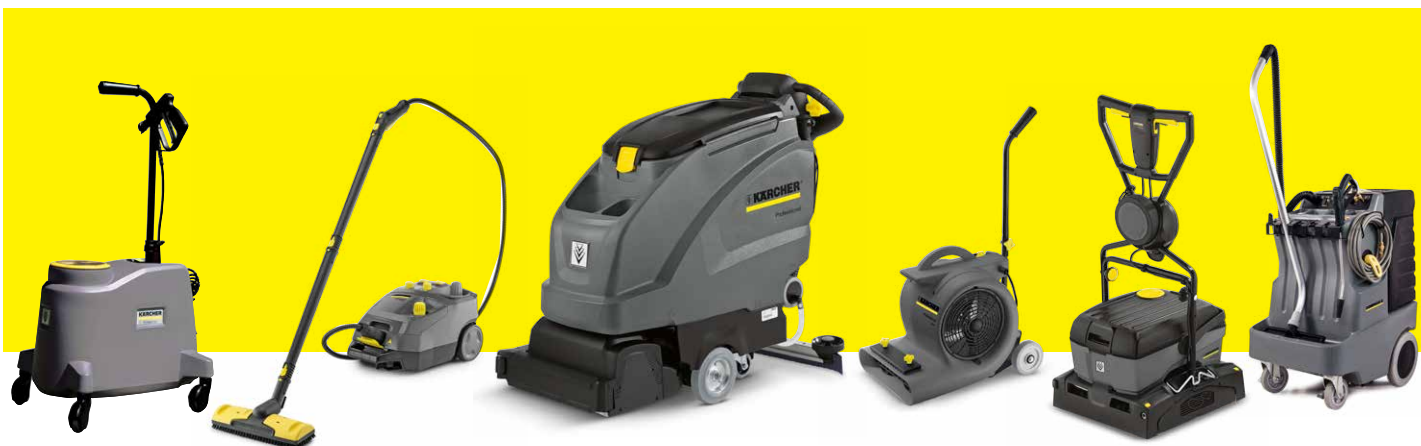
PS 4/7 Bp Mister Specialty

The B 40 scrubber is quiet and can be configured to meet your cleaning needs. The suction bar allows you to pick up water quickly around the pool to prevent slips and falls. An air blower can quickly dry pool splashes and can accelerate dry times after carpet extraction.