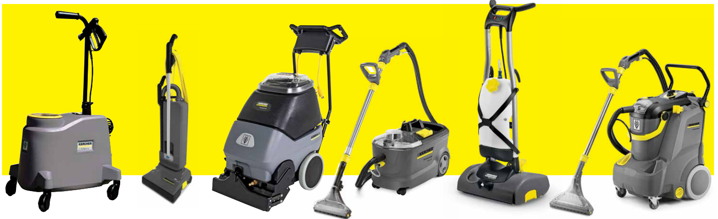
PS 4/7 Bp Mister

The Sensor S2 HEPA includes HEPA final stage filtration for optimal indoor air quality and was designed for daytime cleaning in noise-sensitive environments, while the Admiral 8 makes cleaning easy with an adjustable handle and comfortable fingertip controls.