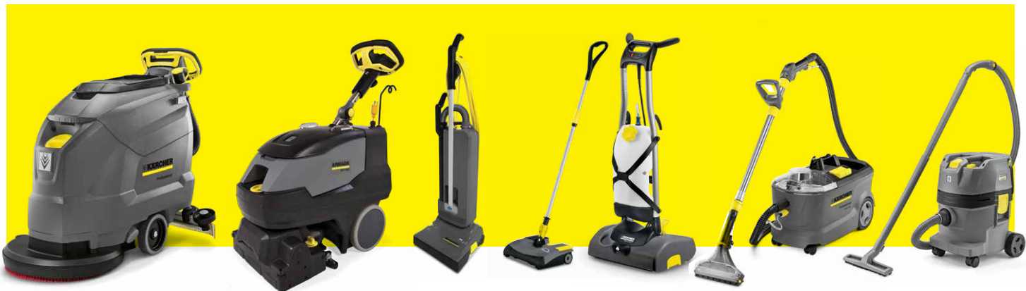
BD 50/50 Scrubber

Kärcher offers the BD 50/50 Scrubber to clean tile, wood or laminate, an Armada for restorative extraction, the Sensor vacuum for daytime cleaning in noise-sensitive environments, and the cordless, battery operated, and ergonomic Radius Mini for quick clean up.