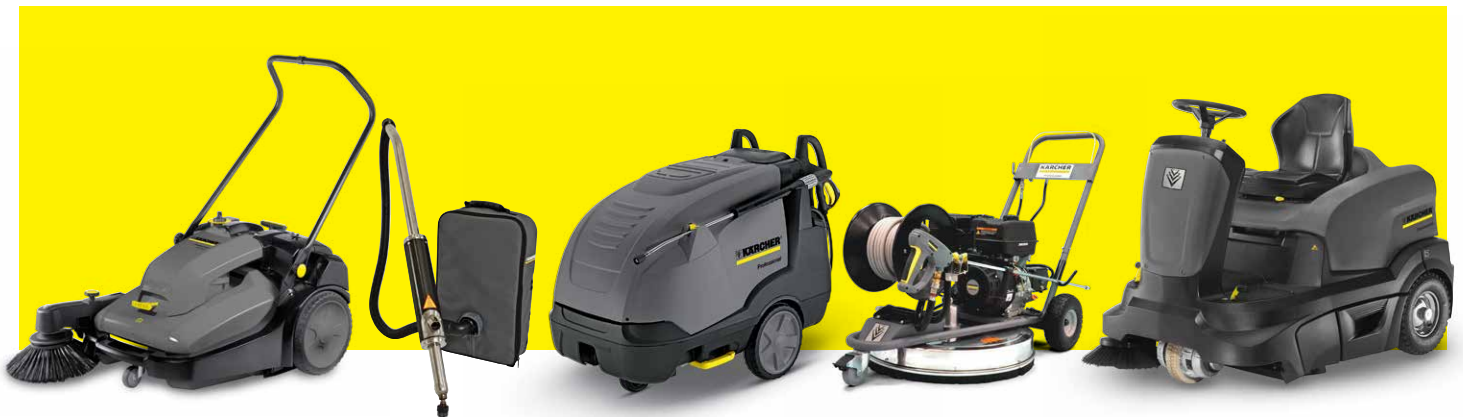
KM 70/30 Bp Sweeper

Fast and effective sweeping can prevent dirt from entering your community with the KM 70/30 Bp and the KM 90/60 R, while the HDS Special Class Hot Water Pressure Washer can clean windows, siding, and sidewalks with ease. This top of the line pressure washer is emission-free, perfect where exhaust gases are undesirable.