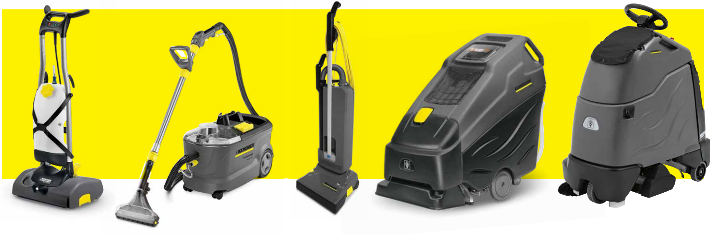
iCapsol BRS 43/500 Interim

We offer efficient and productive cleaning options, so you can provide the best first impression to visitors and residents alike. You and your residents will be confident in the clean achieved with our vacuums, scrubbers, extractors, or spotters. Kärcher puts hygiene first, keeping your main traffic routes clean and safe.