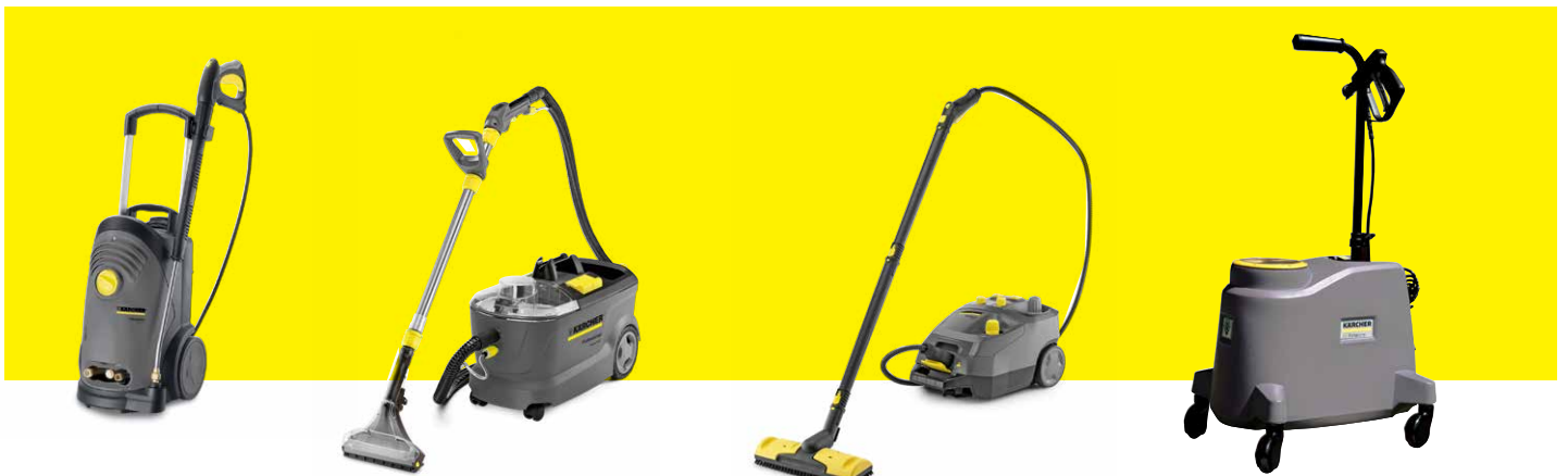
HD Compact Class Pressure Washer

The SG 4/4 steam cleaner and the Puzzi 10/1 Spotter will take care of your detailing needs, while the PS 4/7 Bp Mister can be sprayed inside vehicles to reduce the spread of viruses inside and outside your facility.