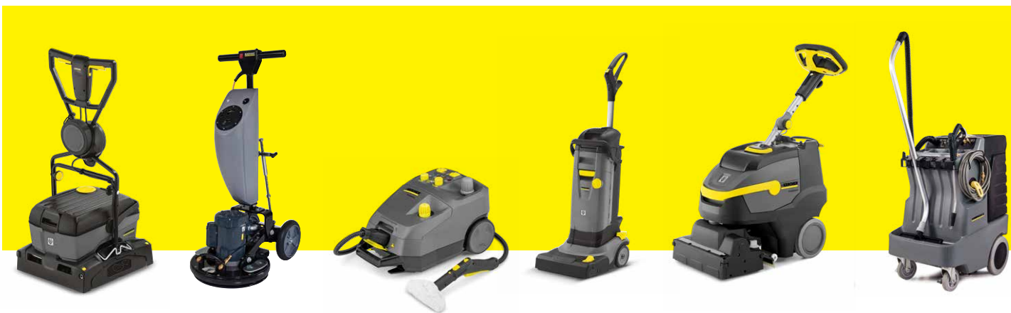
BR 40/10 Scrubber